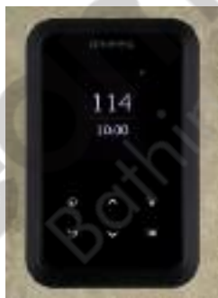
T100 Touch Control