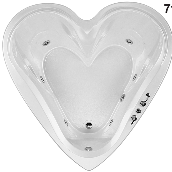
Shown with Standard Therapy Package and optional Fill-Flush.

NOTE: See electrical specifications page for electrical requirements of options.