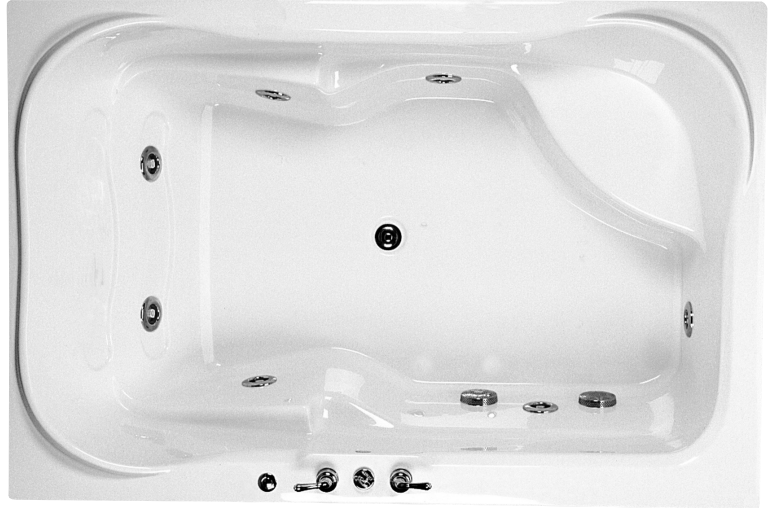
Shown with Standard Therapy Package and optional Fill-Flush.

NOTE: See electrical specifications page for electrical requirements of options.