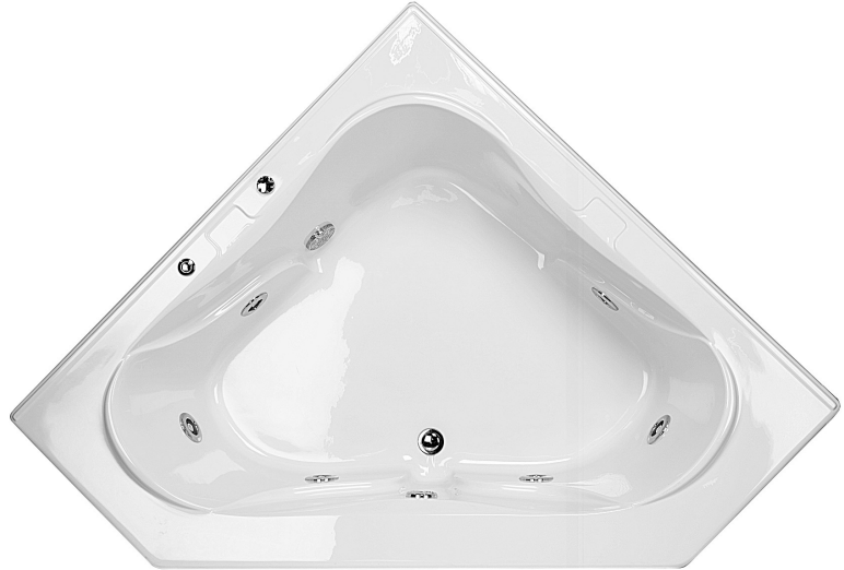
Shown with Standard Therapy Package.

NOTE: See electrical specifications page for electrical requirements of options.