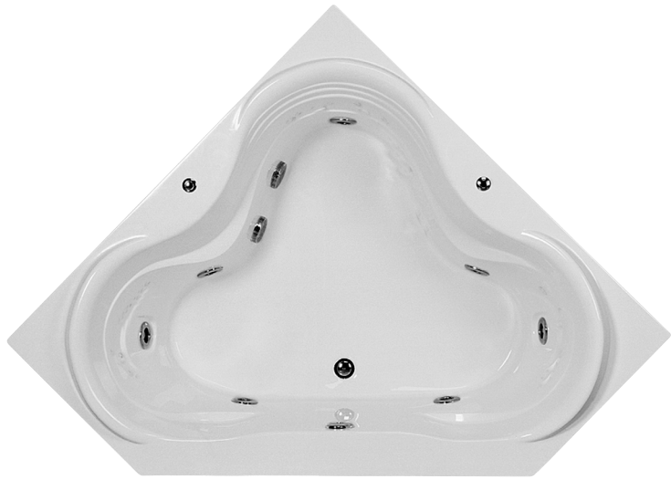
Shown with Standard Therapy Package.

NOTE: See electrical specifications page for electrical requirements of options.