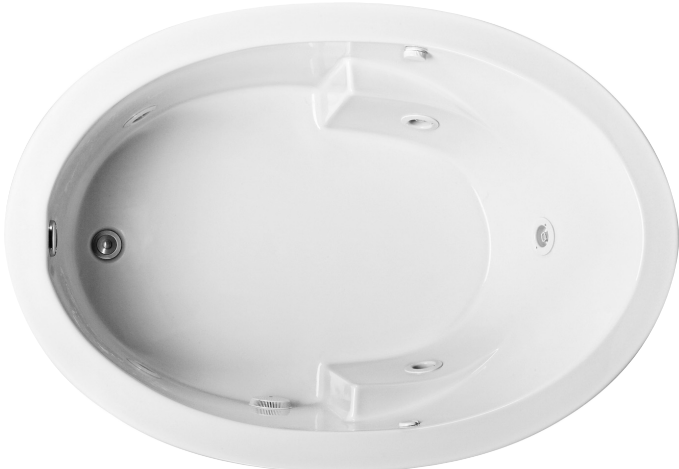
Magnolia features integral armrests. Shown with Standard Therapy Package.

NOTE: See electrical specifications page for electrical requirements of options.