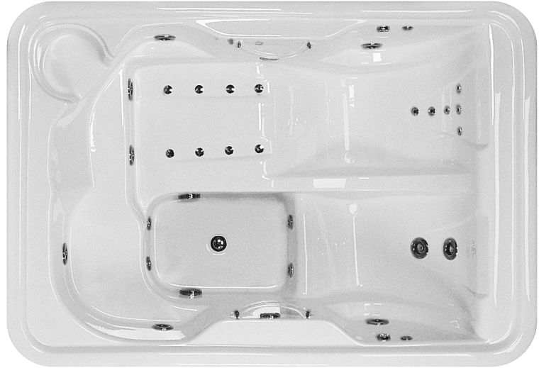
Shown with Ultra-Therapy Package.

NOTE: See electrical specifications page for electrical requirements of options.