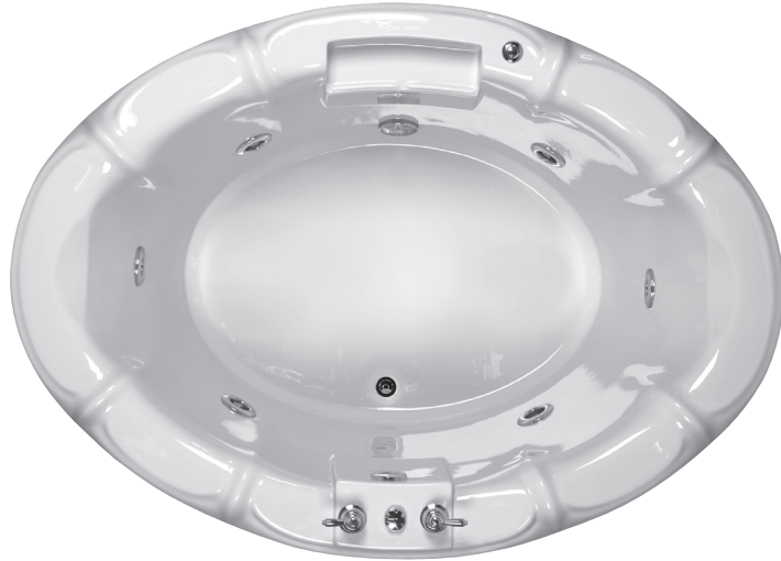
Shown with Standard Therapy Package and optional Fill-Flush.

NOTE: See electrical specifications page for electrical requirements of options.