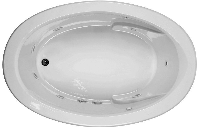
Shown with Standard Therapy Package.

NOTE: See electrical specifications page for electrical requirements of options.