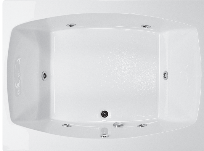
Shown with Standard Therapy Package.

NOTE: See electrical specifications page for electrical requirements of options.