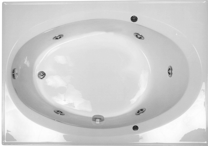
Shown with Standard Therapy Package.

NOTE: See electrical specifications page for electrical requirements of options.