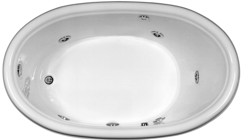
Shown with Standard Therapy Package.

NOTE: See electrical specifications page for electrical requirements of options.