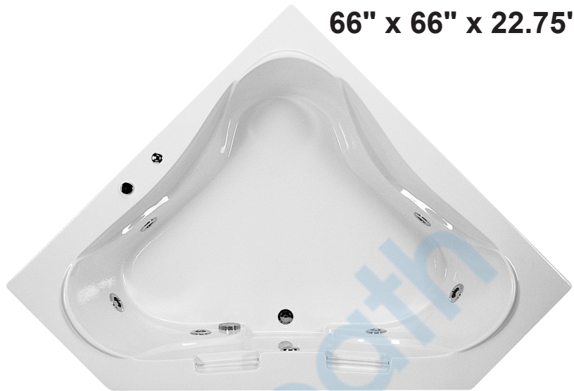
Beaumont 1 includes as standard 2 straight acrylic grab bars. Shown with Standard Therapy Package.

NOTE: See electrical specifications page for electrical requirements of options.