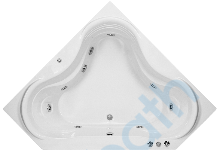
Shown with Standard Therapy Package and optional Fill-Flush.

NOTE: See electrical specifications page for electrical requirements of options.