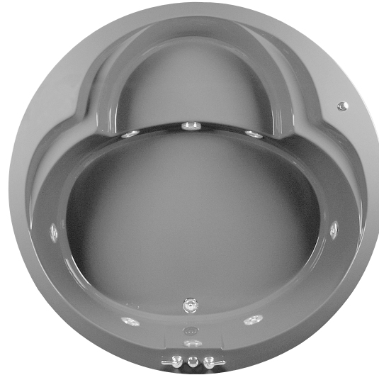
Shown with Standard Therapy Package and optional Fill-Flush.